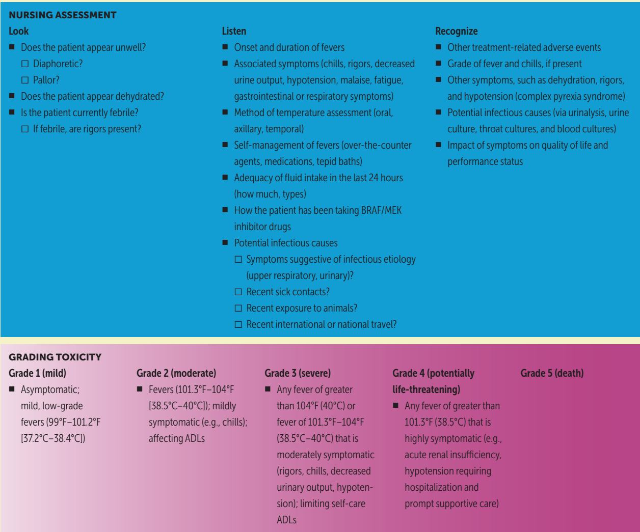
FIGURE 2. CARE STEP PATHWAY FOR MANAGEMENT OF PYREXIA: ELEVATED BODY TEMPERATURE IN THE ABSENCE OF CLINICAL OR MICROBIOLOGIC EVIDENCE OF INFECTION