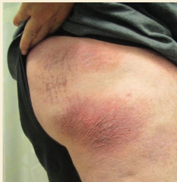
FIGURE 1. Case Study 1 Patient

At the time of this writing, the patient has tolerated treatment for five months with no dermatitis. The patches have faded, smoothed, have a mild-brawny hyperpigmentation, and