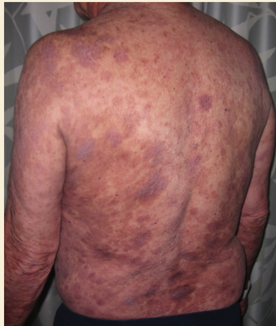
FIGURE 3. Case Study 3 Patient

Note. Photographs courtesy of Dana-Farber/Brigham and Women's Cancer Center. Used with permission.