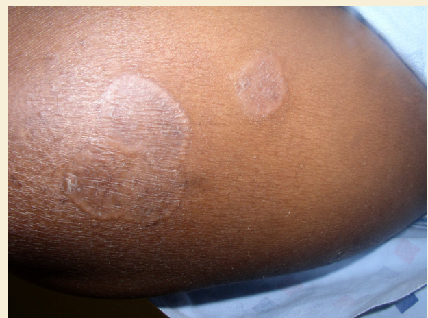
FIGURE 4. Case Study 4 Patient

In July 2011, the patient was diagnosed with MF-CTCL stage Ib (T2N0M0B0); a skin punch biopsy from a patch on her