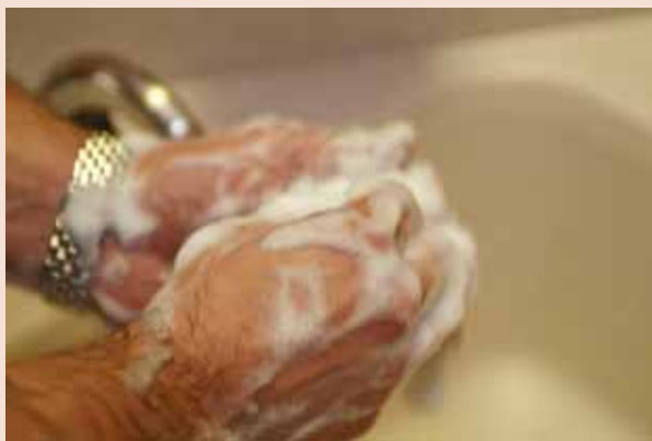
Figure 2. Hand Washing Can Prevent the Transmission of Infection

may be used, although soap and water are preferable if hands are visibly soiled or contaminated with proteinaceous material (Boyce & Pittet). Thorough drying of the hands is important because hands may remain colonized with microorganisms after hand washing if hands are not dried properly (Boyce & Pittet). In clinical situations involving respiratory secretions or handling of objects that may have been contaminated with respiratory secretions, gloves and gowns should be worn (Schulster & Chinn).