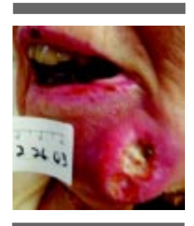
FIGURE 1. ORAL LESION PRIOR TO METRONIDAZOLE THERAPY

Head and neck-related cancers are a growing problem in the United States. In 2004, an estimated 28,260 Americans will be diagnosed with cancers of the oral cavity and pharynx and 7,230 will die from these diseases. Although more common among men, cancers of the head and neck do occur in women, and an estimated 9,710 women will be diagnosed with cancer of the mouth in 2004 (Jemal et al., 2004).