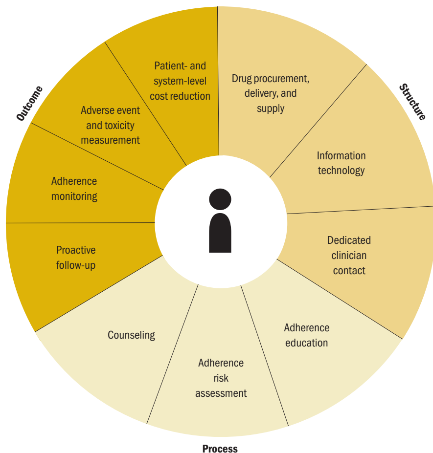
FIGURE 2. Scoping Review Model

This scoping review identified 20 distinct OAM programs reported in the literature, which included an aggregate of 10 components aimed at improving patient adherence. The programs included heterogeneous populations of patients at different phases of adherence. The main components used by the programs included education; counseling; follow-up;