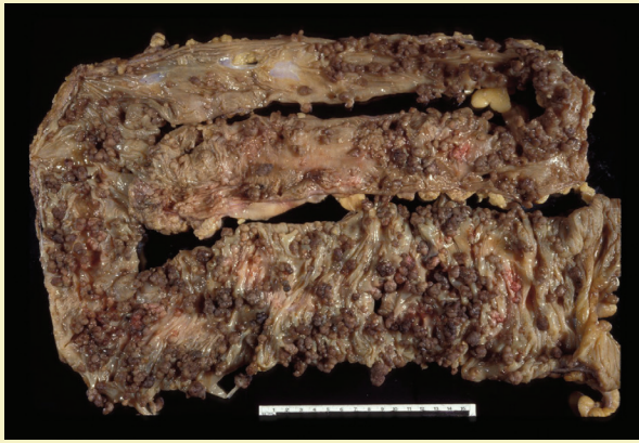
FIGURE 2. SURGICALLY RESECTED BOWEL WITH POLYPS

Note. This surgically resected bowel shows a "carpet of polyps," which is typically seen in familial adenomatous polyposis.