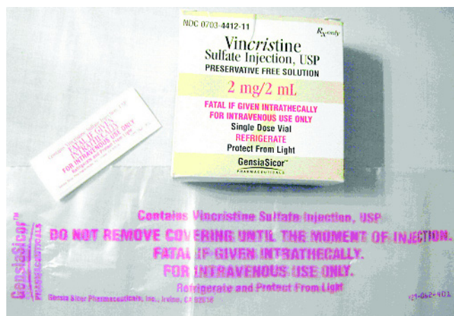
Figure 4. Example of Vincristine Box Label, Syringe Label, and Plastic Overwrap

by appropriately trained staff. Intrathecal and IV chemotherapy should never be dispensed or delivered together. When a patient is scheduled to receive intrathecal and IV chemotherapy treatment, the treatment should be viewed as two distinct procedures that are to be performed at different points in time. At least two clinicians should independently verify intrathecal medications prior to their administration. Intrathecal chemotherapy should be given in designated locations only, and, ideally, the pharmacy staff should deliver intrathecal chemotherapy immediately before use. Prepared intrathecal chemotherapy never should be stored or placed on a counter on a patient care unit or in a patient's room (Dyer, 2001; ISMP, 2003; Root & the British Oncology Pharmacy Association, 2001). In addition, Laws (2001) suggested that medical product manufacturers should develop syringes and equipment for epidural use that are noninterchangeable with IV products.